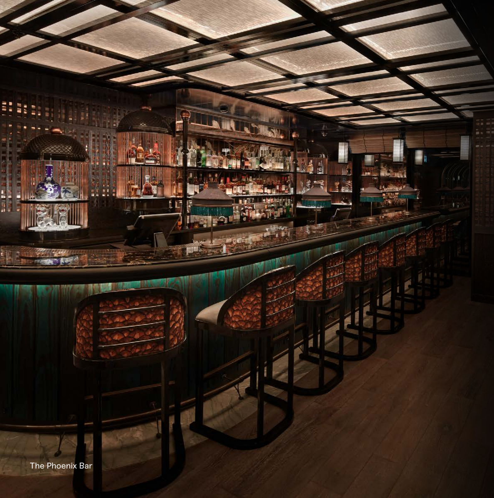
The Phoenix Bar